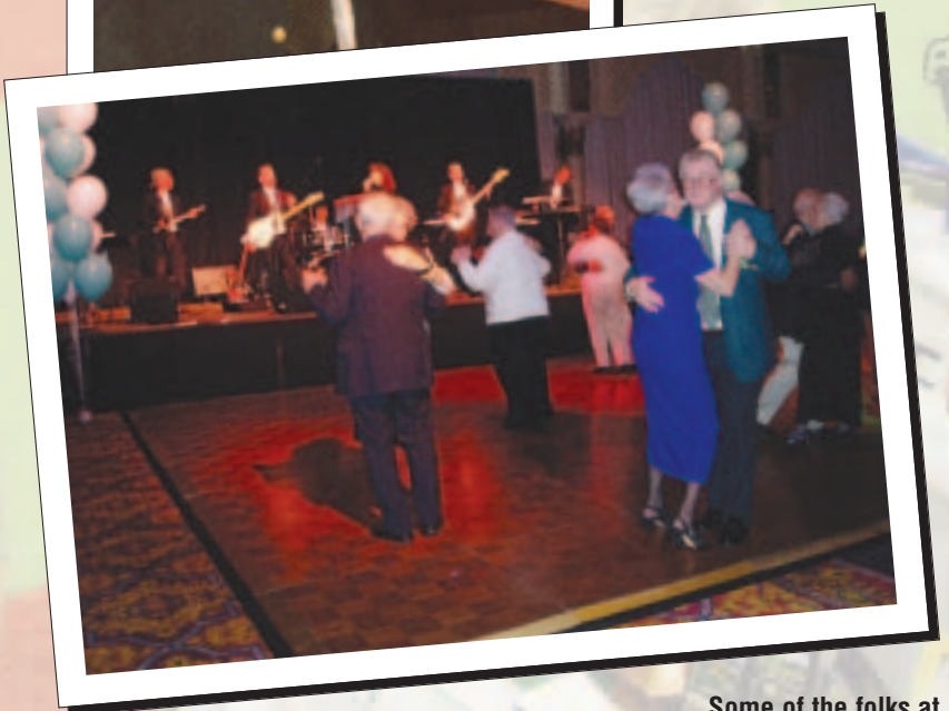
Some of the folks at the Grand Reception enjoying the fine dance music of the band, "Lavender."