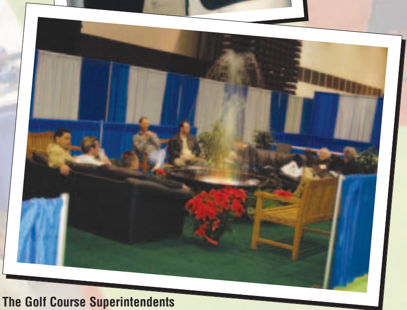
The Golf Course Superintendents Association of New Jersey provided a welcomed "oasis" for members with tired feet to relax and chat with fellow members.